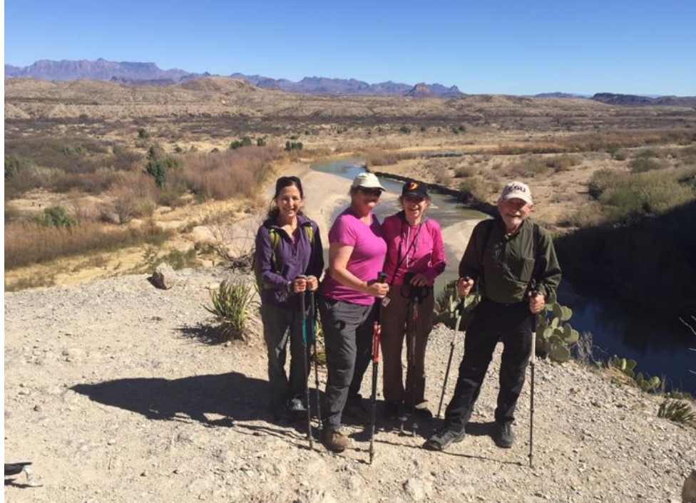
Left and below: Photos from Santa Elena Canyon.